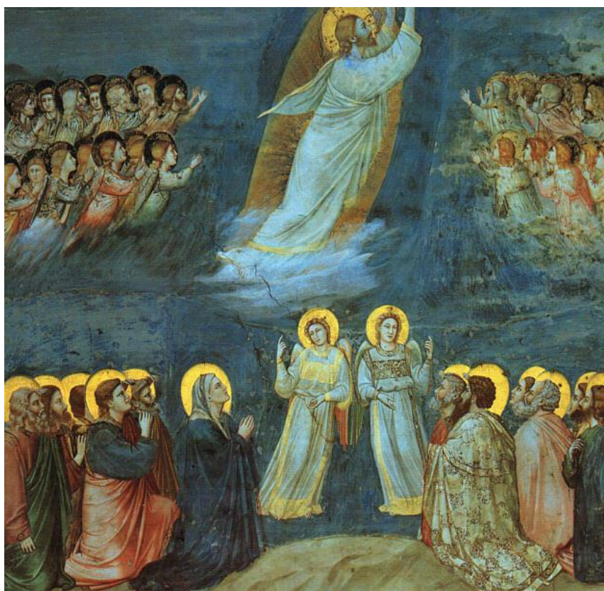
Giotto di Bondone (1267-1337), Cappella Scrovegni a Padova, Ascension